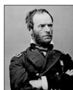
William T. Sherman